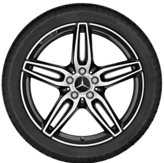
Part #BQ8409054 Front Axle

2018 E-Coupe C238 (E 400 4MATIC) 2018 E-Cab A238 (E 400 4MATIC) 19 inch, 10-spoke wheel High-Shen Tremolite Grey Metallic 245/40R19 98V PIRELLI WINTER SOTTOZERO 3 MOE XL