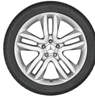
Part #BQ6400148 Front and Rear Axle

2016 – 18 GL/GLS X166 (GLS 63 4MATIC, GL 500/550 4MATIC, GLS 500/550 4MATIC, GL 350 BlueTEC 4MATIC, GLS 350d 4MATIC, GLS 450 4MATIC, GL 350 BlueTEC 4MATIC) 21 inch, AMG multi-spoke wheel Titanium Grey 295/40R21 111V PIRELLI SCORPION WINTER XL BW