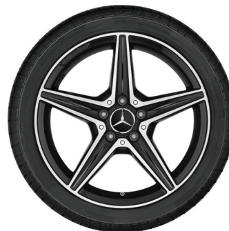
Part #BQ8402538 Front Axle Part #BQ8402539 Rear Axle

2015 – 18 C-Sedan W205 (C 300, C 300 4MATIC, C 350e, C 400 4MATIC) 2016 – 18 C-Coupe C205 (C 300, C 300 4MATIC) 2017 – 18 C-Cab A205 (C 300, C 300 4MATIC) 19 inch, 5-twin-spoke wheel High-Sheen Black Front Axle: 225/40R19 93H PIRELLI WINTER SOTTOZERO 3 XL RFT BW Rear Axle: 245/35R19 93H PIRELLI WINTER SOTTOZERO 3 XL RFT BW