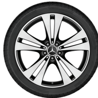
Part #BQ8402545 Front and Rear Axle

2016 – 18 GLC X253 (GLC 43) 2017 – 18 GLC Coupe C253 (GLC 43) 19 inch, AMG 5-twin-spoke wheel High-Sheen Black 235/55R19 101H PIRELLI SCORPION WINTER MOEXTENDED