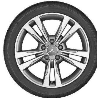
Part #BQ6400156 Front and Rear Axle

2010 – 16 E-Sedan W212 (E 350, E 350 BlueEFFICIENCY, E 350 BlueTEC, E 350 4MATIC, E 400, E 400 4MATIC) 2011–16 E-Wagon S212 (E 350 4MATIC) 17 inch, 5-spoke wheel Sterling Silver 245/45R17 99H CONTINENTAL WINTERCONTACT TS 830 P MO XL BW