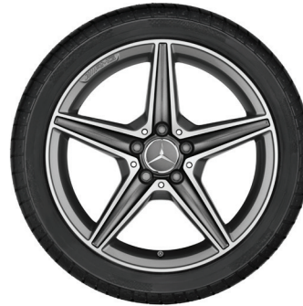
Part #BQ8409051 Front and Rear Axle

2015 – 18 C-Sedan W205 (C 300, C 300 4MATIC, C 350e, C 400 4MATIC) 2016 – 18 C-Coupe C205 (C 300, C 300 4MATIC) 2017 – 18 C-Cab A205 (C 300, C 300 4MATIC) 17 inch, 5-twin-spoke wheel Himalaya Grey 225/50R17 94H DUNLOP SP WINTER SPORT 4D MOE BW