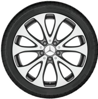
Part #BQ6400159 Front and Rear Axle

2016 – 18 GLC X253 (GLC 300, GLC 350e 4MATIC, GLC 300 4MATIC) 2017 – 18 GLC Coupe C253 (GLC 300 4MATIC) 18 inch, 5-twin-spoke wheel Himalaya Grey 235/60R18 103H PIRELLI SCORPION WINTER MO