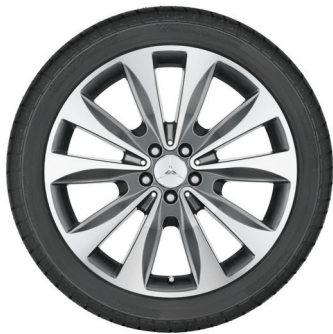
Part #BQ6400149 Front and Rear Axle

2012 – 18 AMG GLE W166 (GLE 63 4MATIC, GLE 63 S 4MATIC) 21 inch, AMG multi-spoke wheel Titanium Grey 295/40R21 111V PIRELLI SCORPION WINTER XL BW