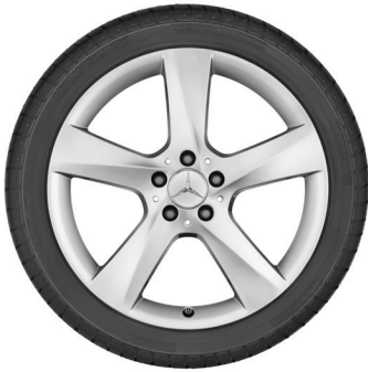
Part #BQ6400147 Front and Rear Axle

2012 – 18 ML/GLE W166 (GLE 300d 4MATIC, ML 350 BlueTEC 4MATIC, GLE 350d 4MATIC, ML 350 4MATIC BlueEFFICIENCY, GLE 350 4MATIC, ML 350, GLE 350, ML 500 4MATIC HYBRID, GLE 500e 4MATIC, GLE 550e 4MATIC) 19 inch, 5-spoke wheel Titanium Silver 255/50R19 107H DUNLOP SP WINTER SPORT 3D XL BW