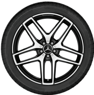
Part #BQ8402544 Front and Rear Axle

2016 – 18 GLC X253 (GLC 43 4MATIC, GLC 300 4MATIC, GLC 350e 4MATIC) 2017 – 18 GLC Coupe C253 (GLC 300 4MATIC, GLC 43 4MATIC) 19 inch, AMG 5-twin-spoke Light-Alloy wheel 235/55R19 101H PIRELLI SCORPION WINTER MOE