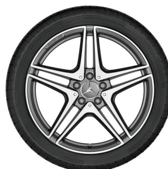
Part #BQ8402542 Front Axle Part #BQ8402543 Rear Axle

2015 – 18 C-Sedan W205 (C 63, C 63 S) 19 inch, AMG 5-twin-spoke wheel Titanium Grey Front Axle: 245/35R19 93V CONTINENTAL WINTERCONTACT TS 830 P MO Rear Axle: 265/35R19 98V CONTINENTAL WINTERCONTACT TS 830 P MO