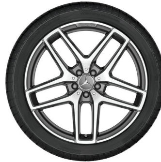
Part #BQ6400160 Front and Rear Axle

2016 – 18 GLC X253 (GLC 300, GLC 350e 4MATIC, GLC 300 4MATIC) 2017 – 18 GLC Coupe C253 (GLC 300 4MATIC) 18 inch, 5-twin-spoke wheel Himalaya Grey 235/60R18 103H PIRELLI SCORPION WINTER MO