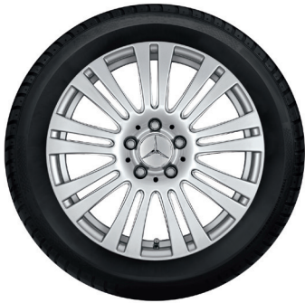
Part #BQ6400154 Front and Rear Axle

2010 – 16 E-Coupe C207 (E 350 CGI BlueEFFICIENCY, E 400, E 550, E 350 4MATIC) 2010 – 16 E-Cab A207 (E 350 CGI BlueEFFICIENCY, E 400, E 550) 17 inch, 9-twin-spoke wheel Titanium Silver 235/45R17 94H PIRELLI WINTER 210 SOTTOZERO BW