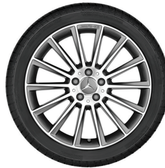
Part #BQ8409050 Front and Rear Axle

2012 – 18 ML/GLE W166 (GLE 300d 4MATIC, ML 350 BlueTEC 4MATIC, GLE 350d 4MATIC, ML 350 4MATIC BlueEFFICIENCY, GLE 350 4MATIC, ML 350, GLE 350, ML 500 4MATIC HYBRID, GLE 500e 4MATIC, GLE 550e 4MATIC) 19 inch, 5-spoke wheel Titanium Silver 255/50R19 107H DUNLOP SP WINTER SPORT 3D XL BW